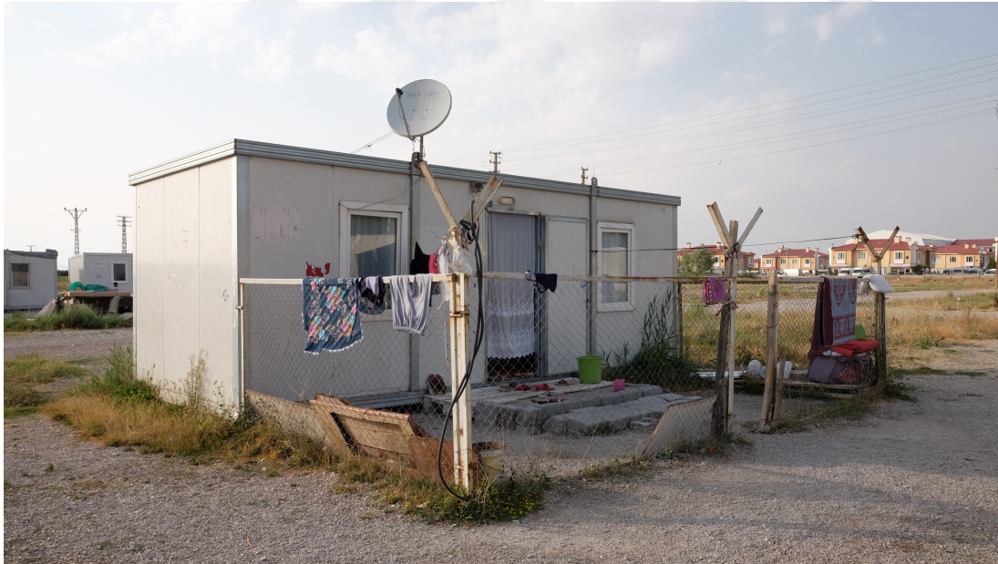
Figure 4.9: A household in Anadolu Container City (Photo by the author, 2017)