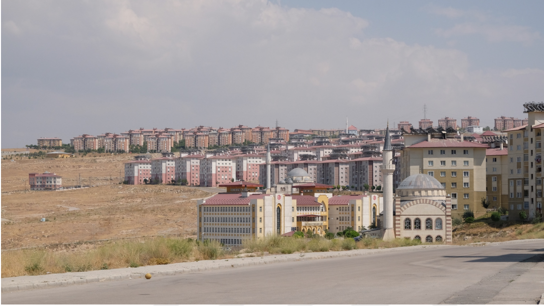
A view from Edremit TOKİ (Photo by the author, August, 2017)