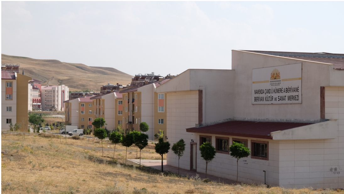
Culture and Art Center at Bostaniçi TOKİ (Photo by the author, August, 2017)