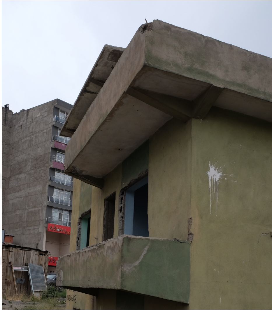
Figure 4.7: Damaged building at the city center (Photo by the author, August, 2017)