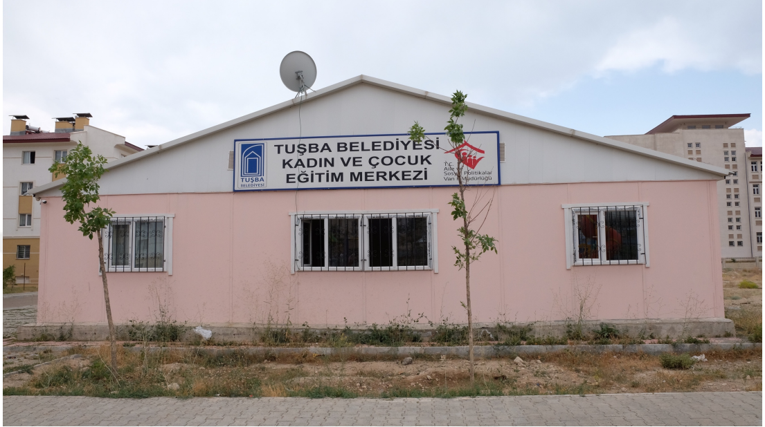
Center for Education of Woman and Children at Kalecik TOKİ providing service under the collaboration of Ministry of Family and Social Policy and Tuşba Municipality (Photo by the author, August, 2017)