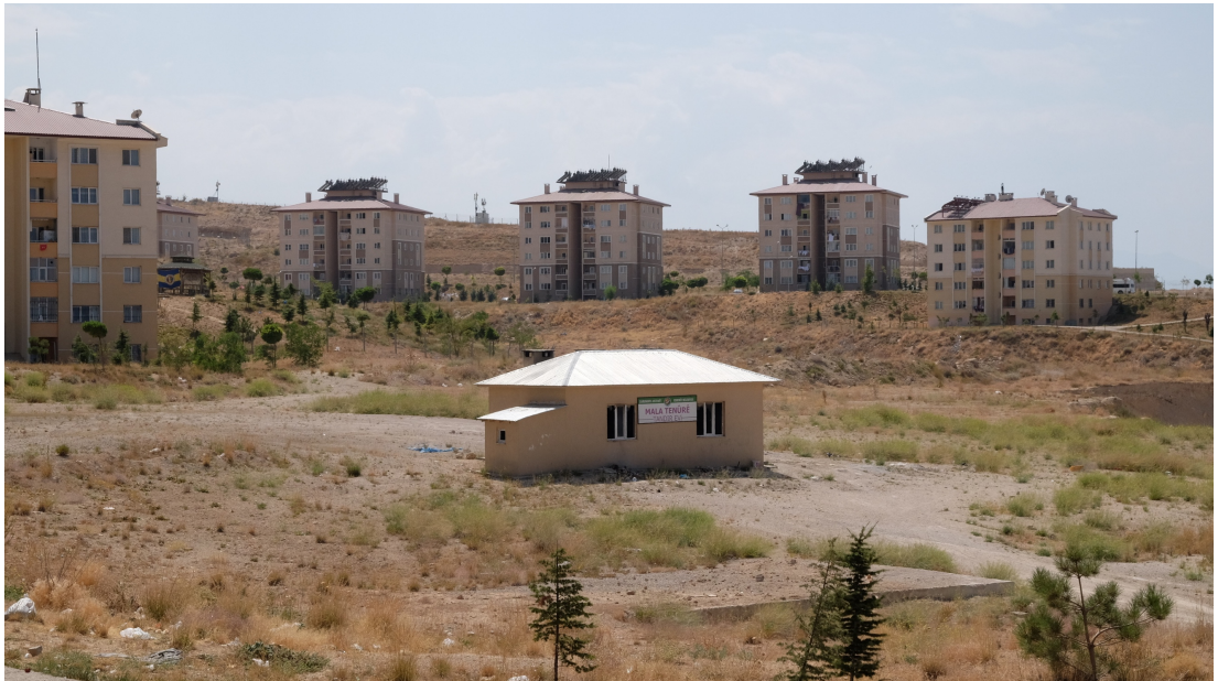
Public bakehouse used by women to cook bread at Edremit TOKİ (Photo by the author, August, 2017)