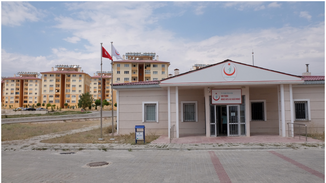
Family Health Center at Kalecik TOKİ operating under the Ministry of Health (Photo by the author, August, 2017)