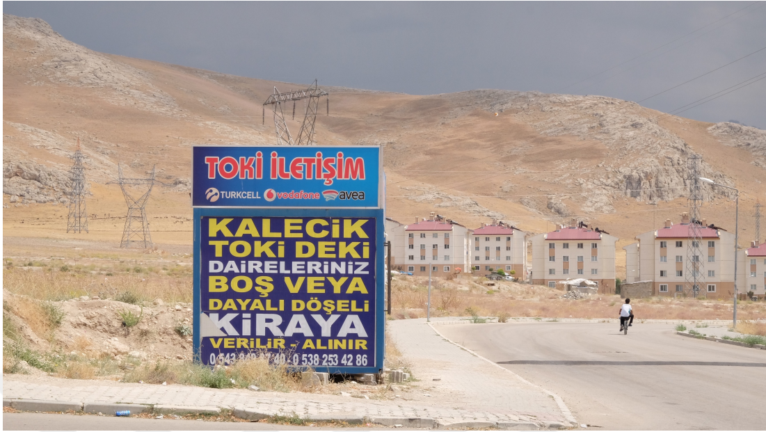
Figure 4.5: A real estate advertisement from Kalecik TOKİ (Photo by the author, August, 2017)