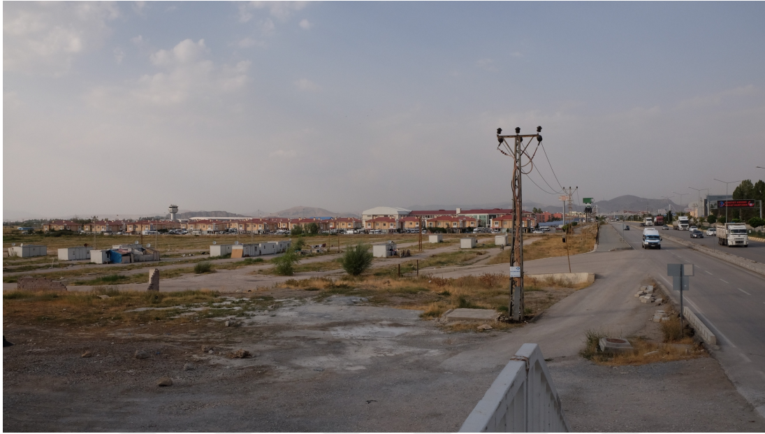
Figure 4.8: Anadolu Container City (Photo by the author, August, 2017)