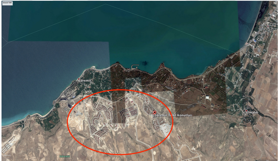
Figure 4.3: Edremit TOKİ Houses & Erdemkent Neighborhood