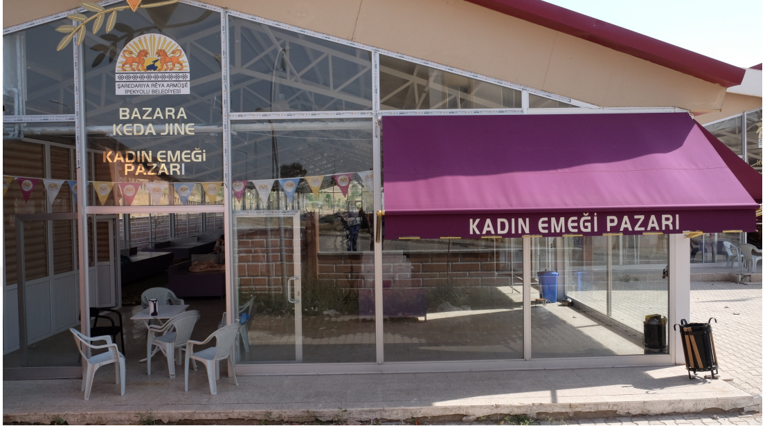
Women's Bazaar to sell handcrafts at Bostaniçi TOKİ (Photo by the author, August, 2017)