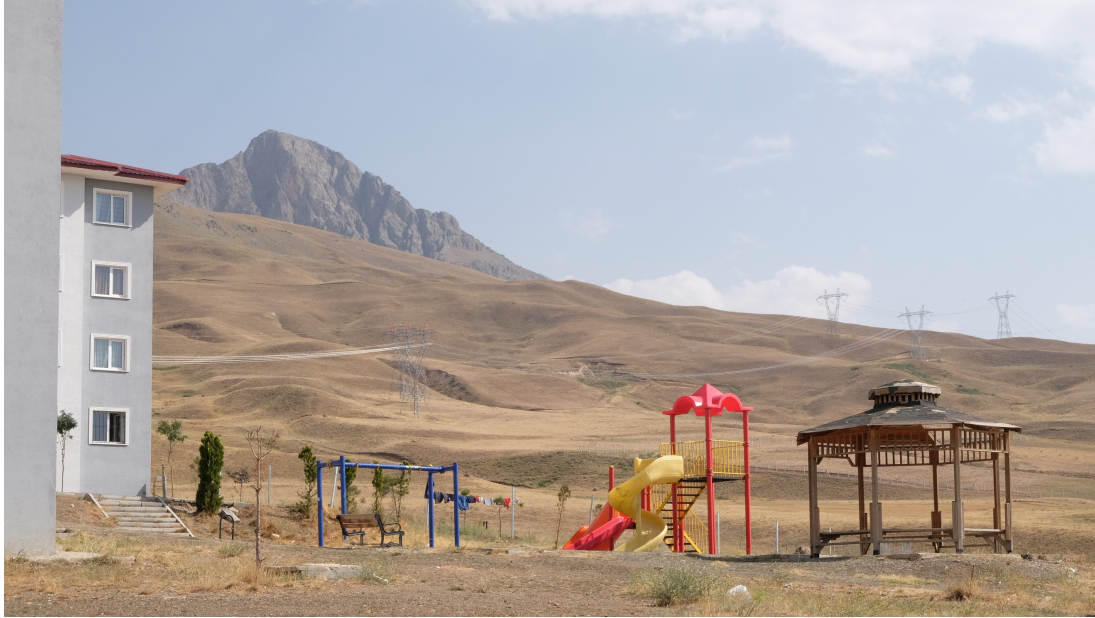
Playground for children at Bostaniçi TOKİ