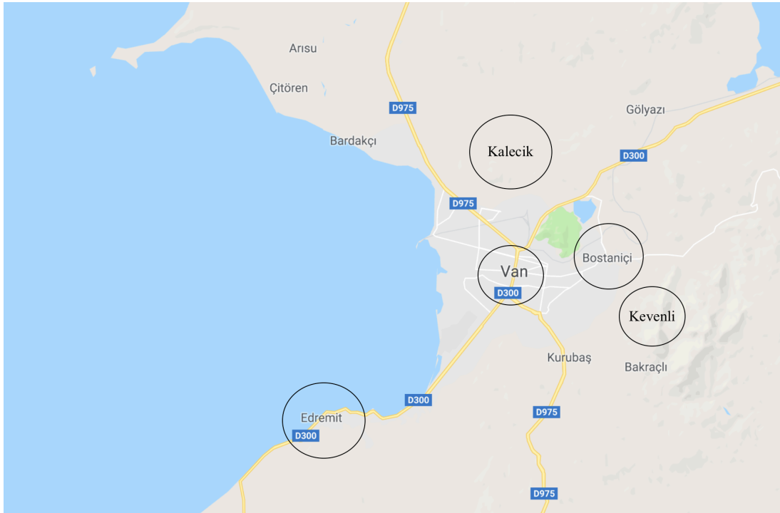
Figure 4.4: Locations of Kalecik, Bostaniçi, Kevenli and Edremit TOKİ regions

We can compare Japan with us in terms of the frequency of earthquakes. Even in there, they do not construct new houses immediately like us. Since some social conditions are important in our country, we provide the right to shelter within a very short period through permanent houses.