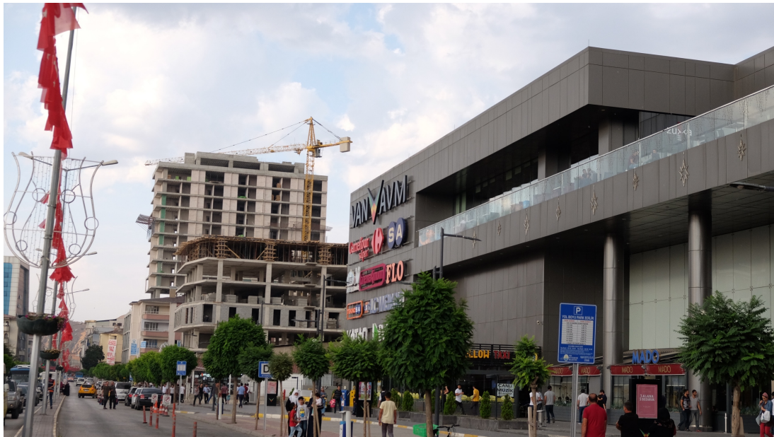
Figure 4.6: High-rise buildings under construction beside a new shopping mall (Photo by the author, August 2017)

traces of the earthquake were totally removed from the city, there still exist some vacant buildings 22 (Figure 4.7).