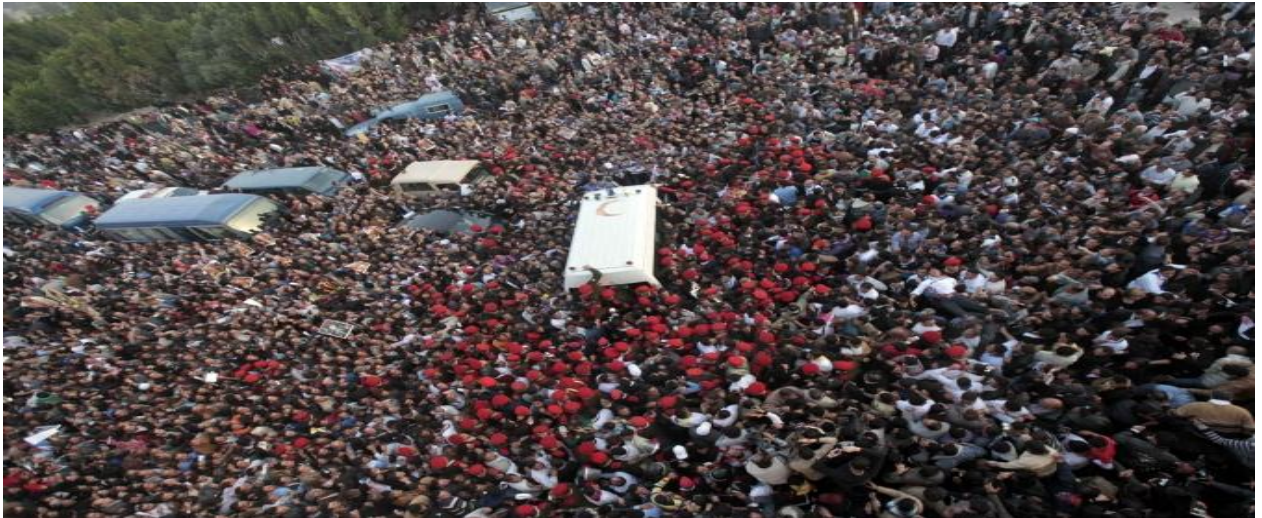
Picture 1 Pope Shenouda III, Funeral Ceremony, March 20, 2012

The Church and its leadership has almost been the “absolute” ruler of the community, therefore no group or individual could challenge it. Even those who reject this authority, as it is in the case of agnostic Buthros Ghali who was nominated as the General Secretary of the United Nation in 1991, individuals had to ask Pope Shenouda’s blessings (Hassan, 2003). In line with this phenomenon, the recently established Coptic groups like Free Copts and the Maspero Youth operate through non-religious means since they are smart enough to know, the number of their followers will decrease if they ever dispute the Church.