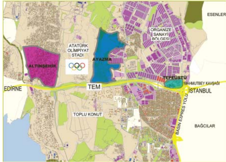
Figure 2. Map of Ayazma and Tepeüstü

Both Tepeüstü and Ayazma neighborhoods have been established in the late 1970s, and their populations have increased during 1980s and 90s due to increase in forced migration from the east because of the ongoing conflict between the armed guerillas and the military. The migrants in Ayazma are mostly from the eastern part of Turkey. The early comers were mainly from Erzurum; but then from various cities including Diyarbakır, Siirt, Adıyaman while Tepeüstü has more mixed population including migrants from the Black Sea Region. 60% of the total area is public land; the remaining parcels belong to different private bodies. The locations of the neighborhoods are important. They border with İkitelli Organized Industrial Zone, Trans European Motorway and are close to Olympic Park (Ayazma is right beside this Olympic complex).