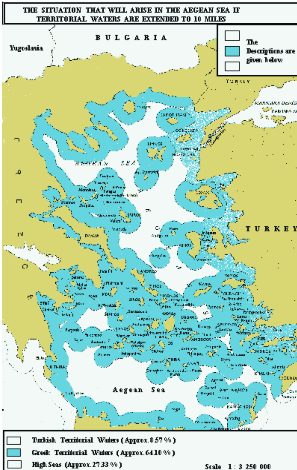
Map 1: Aegean sea with 10 n.m. Greek Territorial sea