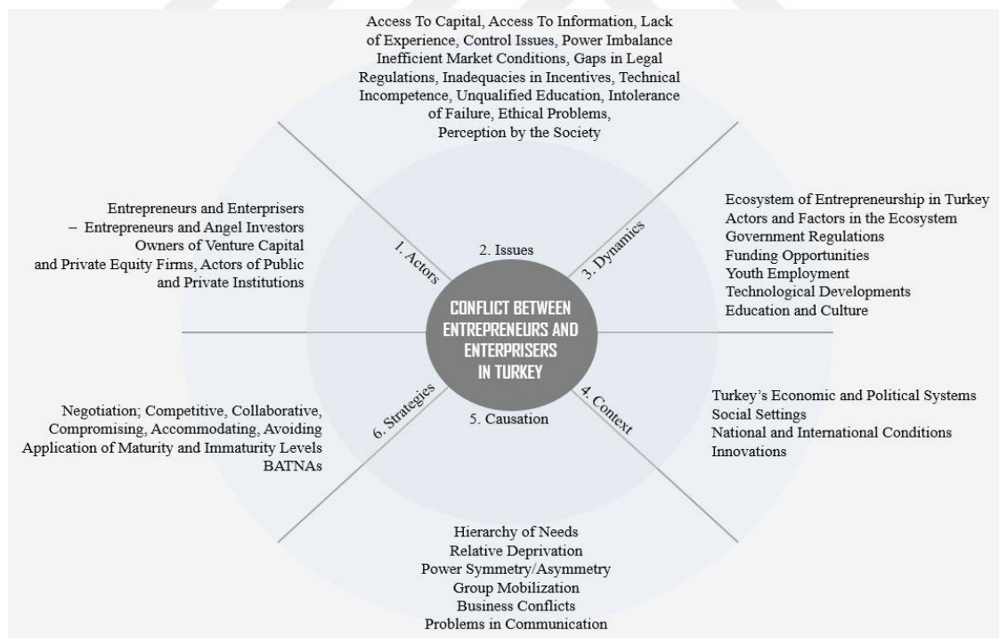
Table 3: Conflict Wheel Analysis on Conflicts between Entrepreneurs and Enterprisers in Turkey

In terms of negotiation, both parties may choose their strategies according to their situation and their BATNA's which will draw the frame for their strategy and methods during negotiations such as avoiding, collaborating, competing, and accommodating as in the dual concerns model which manages many conflicts of individuals for their own interest and for others' interests. 164 In this sense, the conflict between parties include many elements that conflict analysis and resolution gives meaning to.