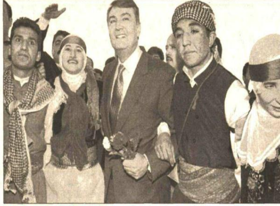
Baykal ile parti yöneticileri, dün sabah Siirt'te uzun bir konvoy ve davul zurnalarla karşılandı.

Baykal, "Kadın yaşamın kendisidir. Yarındır, irticidir, doğurgandır. Kadın demek barış demektir, sevgi demektir" dedi. Türkiye'nin tüm sorunlarının gelip kadınları bulduğuna dikkat çeken CHP lideri Baykal, "Hayat mı pahalı, terör mü var, ölüm mü var,