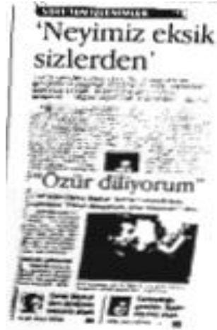
Figure 3. Milliyet's coverage on the CHP congress in 1998. "What do we lack?"

women's experiences in the eastern and western regions of Turkey and what kind of a tension it conceives.