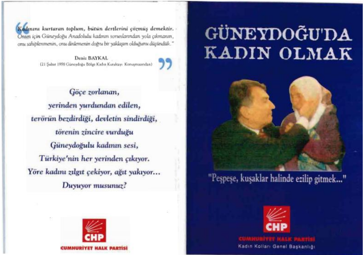
Figure 1. The cover page of the CHP pamphlet.

Before embarking on a discourse analysis of the pamphlet, I would also like to draw its outline and make a brief comment on its structure. The pamphlet opens with a picture that shows the CHP leader, Deniz Baykal, touching the face of a “stereotypical,” veiled woman (See Picture 1). The image conveys a feeling of intimacy to the audience. However, the only picture included in the pamphlet is the one that depicts the male leader of the party, Deniz Baykal. There is no visual that demonstrates the door-to-door visits of women, which is surprising considering the fact that both the congress and the pamphlet are the results of the women’s branch’s efforts. The picture that portrays Baykal and the typical elderly woman conveys all too well the message of a compassionate and embracing political leader. This message of compassion is