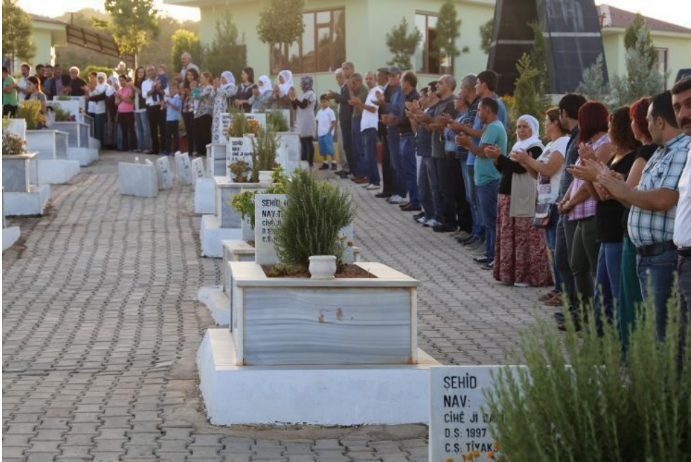
Figure 4: A ceremony in guerillas cemetery