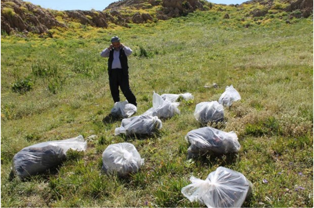
Figure 1: Human remains found at a mass grave site in Şırnak 2014 and members of MEYA-DER said that the bones belong to 12 PKK guerrillas. 67

This study is a kind of forensic investigation to identify and rebury dead. As part of these studies they found many mass graves in different cities. Similar studies have been conducted in the different countries have experienced the periods of intense violence such as Spain, Argentina, Chile, Peru, Spain, Rwanda, Cambodia, and Korea in the last two decades. Bodies have been exhumed for the needs of criminal investigation for these countries. Crossland argues that “forensic and humanitarian exhumation is both located both as part of a tradition of judicial inquiry and as a necessary step in the completing of funerary ritual” (2015: 241). Excavation take place in order to prosecute legal cases, to provide bodies for relatives and to allow grieving in these countries. Although the same process has started in North Kurdistan, forensic products did not provide same consequences in the context of Kurdistan. Forensic studies stopped after the conflicts started again in 2015, so MEYA-DER also gave up studying on mass graves.