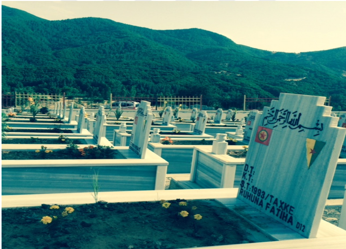
Figure 6: Neither dates of birth and death nor place of death is written on almost all of the gravestones at Xerzan Martyr Cemetery.