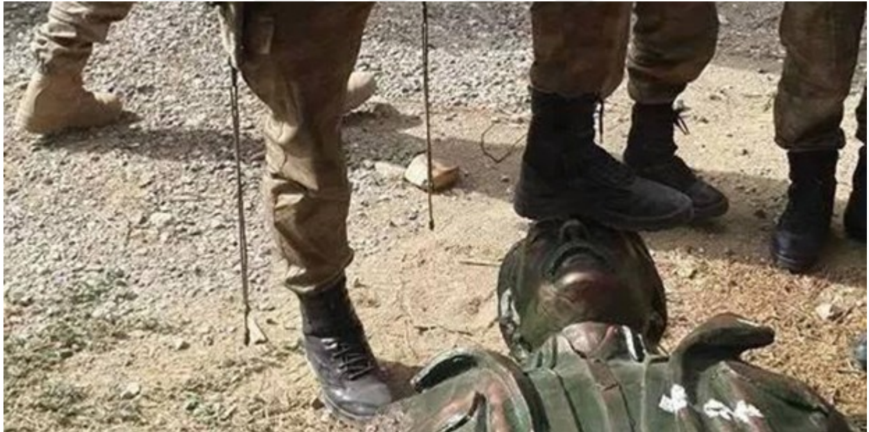
Figure 3: Soldiers posing with one's foot stomped on the sculpture of Mahsun Korkmaz 80

Haveller made that decision that they wanted to make an opening because they wanted to make an official declaration of martyrdom. But that martyrdom was accepted as a cemetery. So they did not destroy it, it was not hidden from the public. But that sculpture was not allowed and accepted by the state. They destroyed it. (2016)