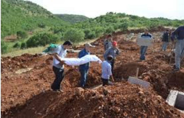
Figure 2: Martyr Hevidar and Martyr Amed Cemetery. When the locals are burying a guerrilla.

However, this process is not only the finding and burial of corpses, but also a process of creating an archive of the missing people.