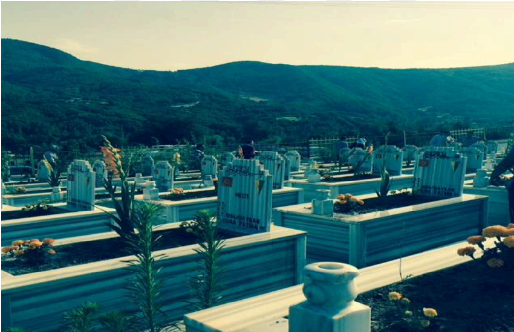
Figure 5: Bitlis Şêccuman Cemetery, composed mostly of anonymous graves.

PKK guerillas who were able to find a few hundred corpses of those who lost their lives during the war has been an ongoing process of over 40 years, moving the bodies one by one to the cemeteries, as it is very difficult to find bodies buried in the ground after long years, especially of the guerillas who were buried in mass graves, “dumped” in waste yards and who collectively died in the airstrikes. Therefore, most of the graves are anonymous, their occupiers unidentified. Neither dates of birth nor place of death are written on almost all of the gravestones at Martyr Dr. Baran and Martyr Besê Cemetery . What is the significance of meanings in martyr cemeteries where bodies that cannot be clearly identified are buried? Are the properties of corpses “good to think” as symbols in Lévi-Strauss's words? (Lévi-Strauss 1991, 89)